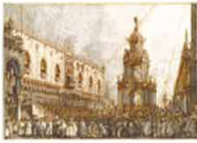
Canaletto, The Maundy Thursday Festival before the Ducal Palace in Venice , c. 1765, pen and brown ink with gray wash, heightened with white gouache, over black chalk on laid paper. National Gallery of Art, Wolfgang Ratjen Collection

The splendors of Italian draftsmanship from the late Renaissance to the height of the neoclassical movement are showcased in an exhibition of 65 superb drawings assembled by the European private collector Wolfgang Ratjen (1943–1997) and acquired by the National Gallery of Art in 2007. Works by many of the most important artists of the period are featured, from Giulio Romano to Giovanni Domenico Tiepolo. Outstanding examples include those by such leading Venetian masters as Domenico Tintoretto, Giovanni Battista Piranesi, and Canaletto, whose elegant rendering of the "Giovedì Grasso" festival in Venice is one of his finest surviving drawings.