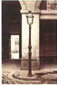
Charles Marville, Hôtel de la Marine , c. 1872-1876, albumen print, National Gallery of Art, Washington, Diana and Mallory Walker Fund

National Gallery of Art, Washington, Early 2013