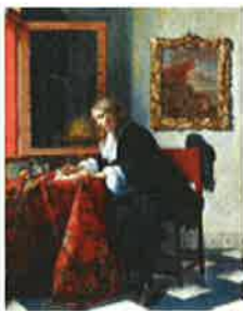
Gabriel Metsu, A Man Writing a Letter , c. 1664-1666, oil on panel, National Gallery of Ireland, Dublin

National Gallery of Art, Washington, April 10–July 24, 2011