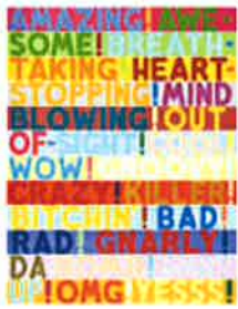
Mel Bochner, Amazing! , 2011, oil and acrylic on canvas, two panels.

For 45 years Mel Bochner has explored the intersections of linguistic and visual representation. As one of the innovators of conceptual art during the 1960s, Bochner questioned the modernist inclination for a purely visual art by conjoining visual form and language. The exhibition will present some 40 works that span the artist's career, including four large vertical diptychs that have never been exhibited before ( Master of the Universe , Oh Well , Amazing! , and Babble ); four horizontal works ( Money , Die , Useless , and Obscene ); the red monochrome Blah ; and the vertical painting Sputter . Also included is a large group of Thesaurus drawings, including several works that have never been shown from Bochner's private collection. Our In the Tower series of exhibitions centers on developments in art since midcentury.