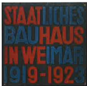
Staatliches Bauhaus Weimar 1919-1923 , Weimar; Munich, 1923, National Gallery of Art Library, David K. E. Bruce Fund

National Gallery of Art, Washington, July 25–October 28, 2011