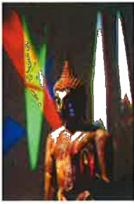
Installation view of In the Tower: Nam June Paik with One Candle, Candle Projection , 1988–2000, and Standing Buddha with Outstretched Hand , 2005.

Born in Korea, and trained in Japan and Germany in aesthetics and music, Nam June Paik (1932–2006) became a pioneer in the integration of art with technology and performance. Drawn from Paik's estate as well as the Gallery's own collection, the exhibition of 20 works is centered on one of Paik's most dynamic pieces, One Candle, Candle Projection (1988–2000), in which a candle is lit daily and a video camera follows its progress. Two other "closed-circuit" works share the main gallery, one involving eggs, the other a bronze Buddha. The adjoining room features works on paper and a short film about the artist.