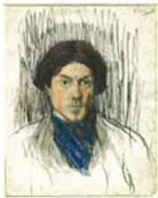
Pablo Picasso, Self-Portrait , 1901/1902, black chalk and watercolor, National Gallery of Art, Washington, Ailsa Mellon Bruce Collection

National Gallery of Art, Washington, January 29–May 6, 2012