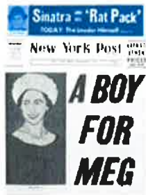
Andy Warhol, A Boy for Meg , 1962, oil on canvas, National Gallery of Art, Washington, Gift of Mr. and Mrs. Burton Tremaine. © 2011 The Andy Warhol Foundation for the Visual Arts, Inc. / Artists Rights Society (ARS), New York

The Andy Warhol Museum, Pittsburgh, October 14, 2012–January 6, 2013