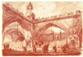
Hubert Robert, Architectural Fantasy with a Triumphal Bridge , c. 1760, red chalk on laid paper, National Gallery of Art, Washington, The Armand Hammer Collection

National Gallery of Art, Washington, through November 2011