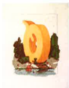
Claes Oldenburg, The Letter Q as Beach House, with Sailboat , published 1972, National Gallery of Art, Washington. Gift of Gemini G.E.L. and the Artist

National Gallery of Art, Washington, May 14–November 13, 2011