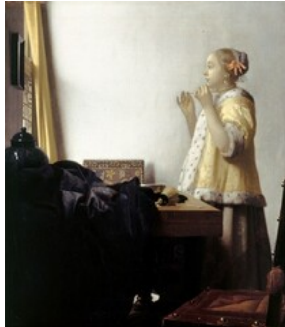
fig. 6 Johannes Vermeer, Woman with a Pearl Necklace, c. 1662–1665, oil on canvas, Staatliche Museen zu Berlin, Gemäldegalerie.