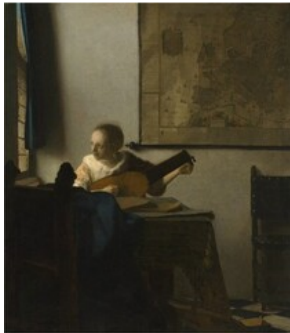
fig. 4 Johannes Vermeer, A Woman with a Lute, c. 1663–1664, oil on canvas, The Metropolitan Museum of Art, New York, Bequest of Collis P. Huntington, 1900, 25.110.24.