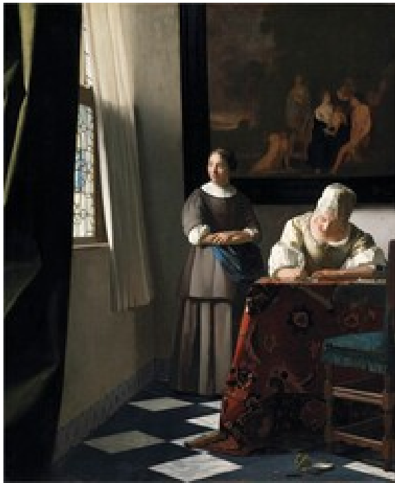
fig. 5 Johannes Vermeer, Woman Writing a Letter, with Her Maid , c. 1670–1671, oil on canvas, National Gallery of Ireland, Dublin, Sir Alfred and Lady Beit, 1987 (Beit Collection), NGI.4535. NOTES