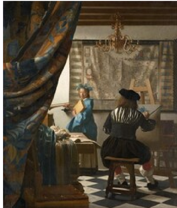
fig. 2 Johannes Vermeer, The Art of Painting , c. 1666/1668, oil on canvas, Kunsthistorisches Museum, Gemäldegalerie, Vienna