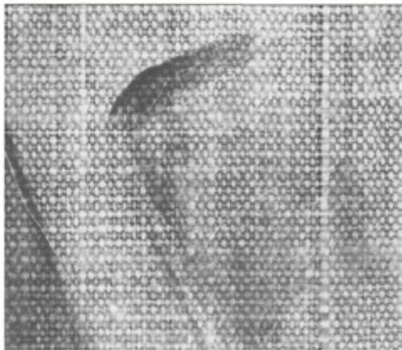
fig. 1 Magnified patch of intensity-inverted radiograph negative of Johannes Vermeer's The Art of Painting , c. 1666/1668, oil on canvas, Kunsthistorisches Museum, Gemäldegalerie, Vienna